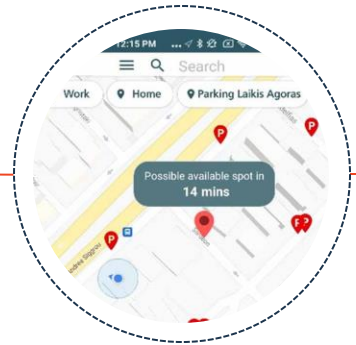
Driver's mobile app

wi.MOVE dashboard provides real-time sensor and devices management, event detection, parking spaces occupancy trends, as well as reporting on payments, violations and more. Daily, weekly, monthly and custom reporting, tailored to the municipality or parking facility needs, as well as sales monitoring and forecasting capabilities are also provided.