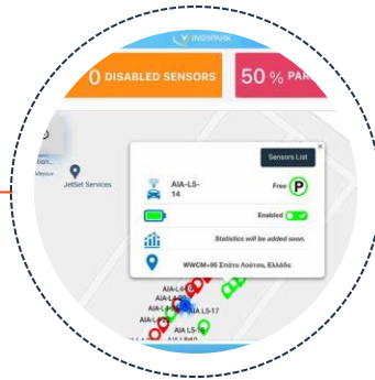
Highly descriptive dashboard

wi.MOVE includes a powerful low cost, energy efficient sensor able to detect the presence of a vehicle with 99% reliability and a battery life reaching up to 10 years, retrieving data and transmitting them over any available network.